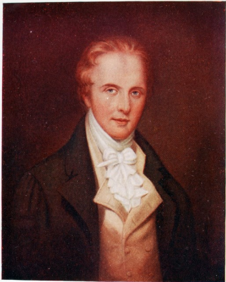
THOMAS DOUGLAS, FIFTH EARL OF SELKIRK