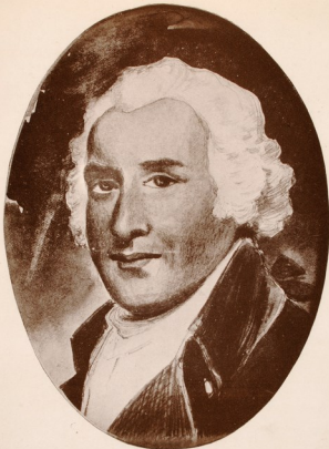
SIMON M'TAVISH, FOUNDER OF THE NORTH-WEST COMPANY

From a water-colour drawing in M'Gill University Library