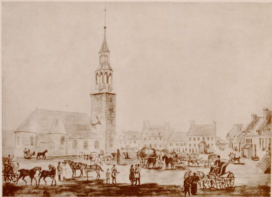
PLACE D'ARMES, MONTREAL, IN 1807